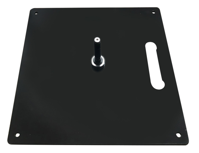
Square Steel Base FAL-SF-BASE