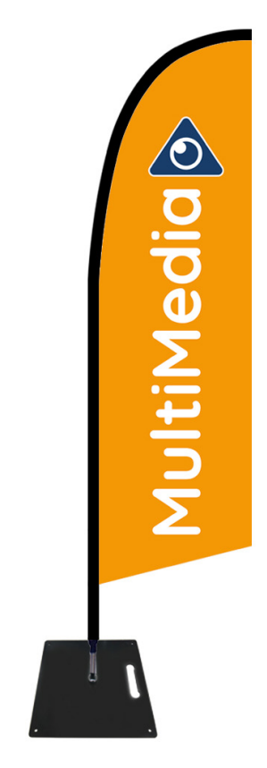
Single Sided Flag