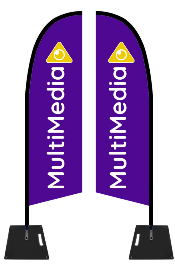
Double Sided Flag